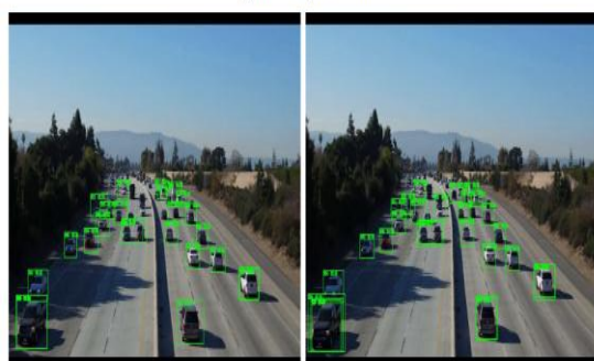
(b) Constant Speed Model