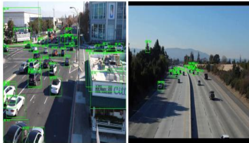
Figure 3. Detection error. (Best viewed in color)

The modification of the local movement to vehicle speed relationship will be insignificant for tiles small enough. Thus, we think of a model that predicts the speed, called a predicted speed (PS) model.