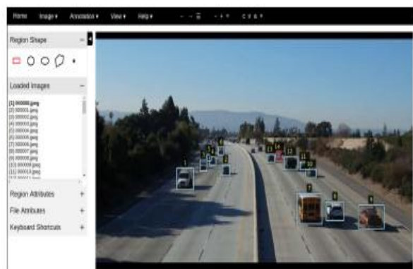
Figure 2. VGG image annotation tool.

four distinct trajectories Track 1 video locations and speed limits in one direction are summarized in Table 1. The direction in which we are heading has the