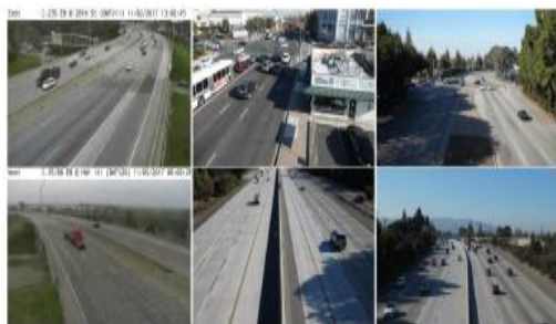
Figure 1. A sample of images captured at traffic intersections and highway.