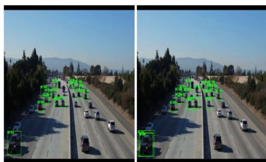
(a) Predicted Speed Model

method, and outlined our answers to the first set of challenges in this year's NVIDIA AI City Challenge. Although our model fared well, we were unable to keep up with the other Challenge entrants due to its high degree of unpredictability. We did not have enough time to evaluate our approach to existing detectthen-track algorithms, but we will do so in future work. Ad-