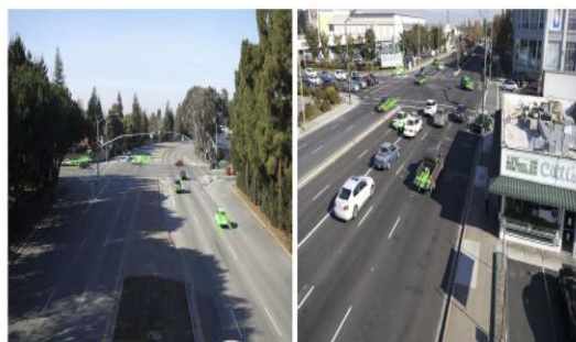
Figure 4. Tracklets obtained through optical-flow estimation. (Best viewed in color)